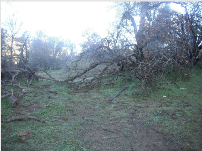
Before removing trees from trail