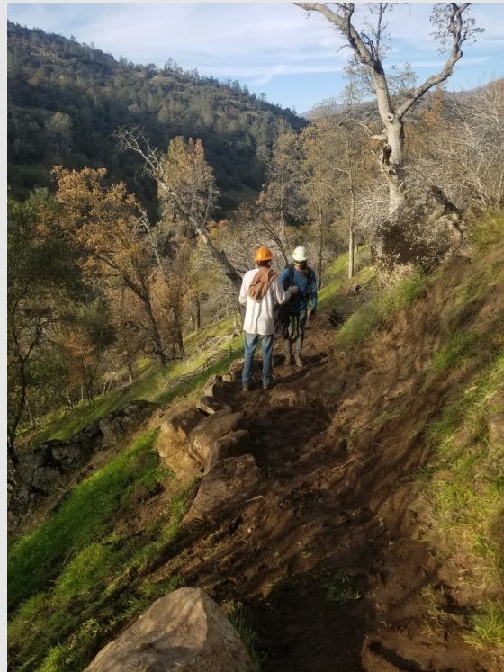
Trail after 75% filled, almost finished