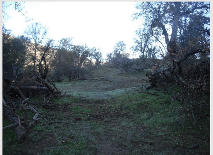
After removing trees from trail