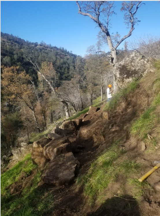
Removing big rocks to create wall trail