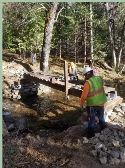
Bridge being constructed over creek