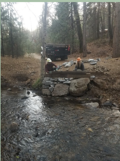
New bridge footing being constructed