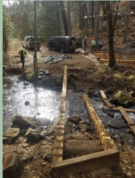
Taking old bridge apart to install new bridge