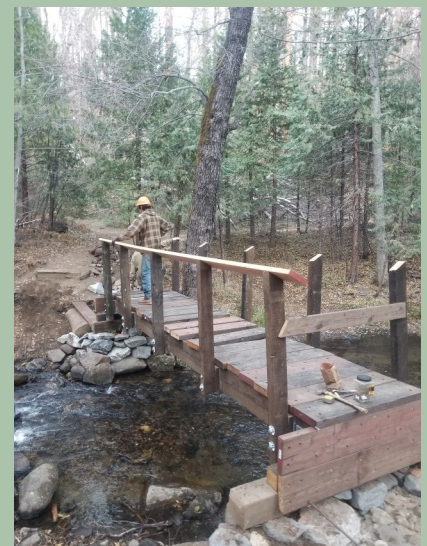
New bridge being installed