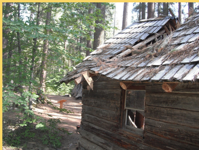
Tree removed from cabin in Nelder Grove