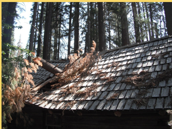
Tree that fell on a cabin in Nelder Grove

The crew has been very busy this past month. They are still working in Yosemite in the Merced Grove area with Calaveras Healthy Impact Solutions (CHIPS). The crew is still working in the Rancheria on the YSRCDC BSR PG&E Powerline Project, clearing and cutting brush under the powerlines to reduce fire activity. The crew worked four days on the Lewis Creek Trail and in the Nelder Grove area near Oakhurst, where they cleared trees and prepped for bridge building. For the Big Sandy Rancheria Native Youth Golf Tournament, we had three employees volunteer to work, and two employees that participated. Everyone had a great time. If you have any questions please contact Rick Fleming, WFD Director (559) 374-0066 ext. 230.