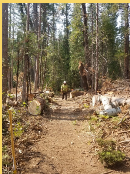
Cutting trees out of the way of the trail